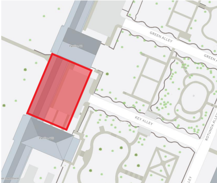
Red area denotes overall construction area.