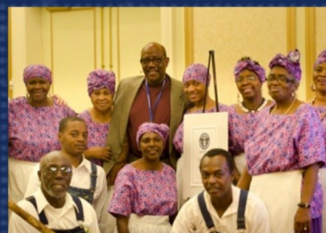
Geechee Gullah Ring Shouters

Moment of Silence as the Chapel Bells Ring (12pm)