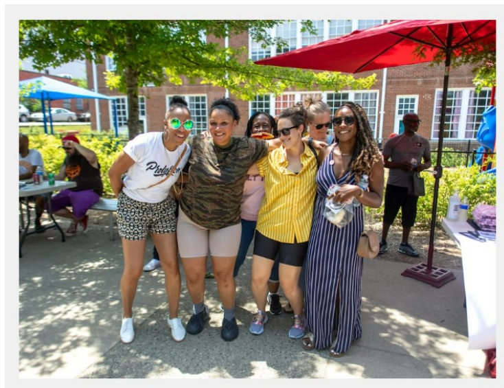
The Jefferson School African American Heritage Center hosts an annual Juneteenth parade, concert, and festivities.