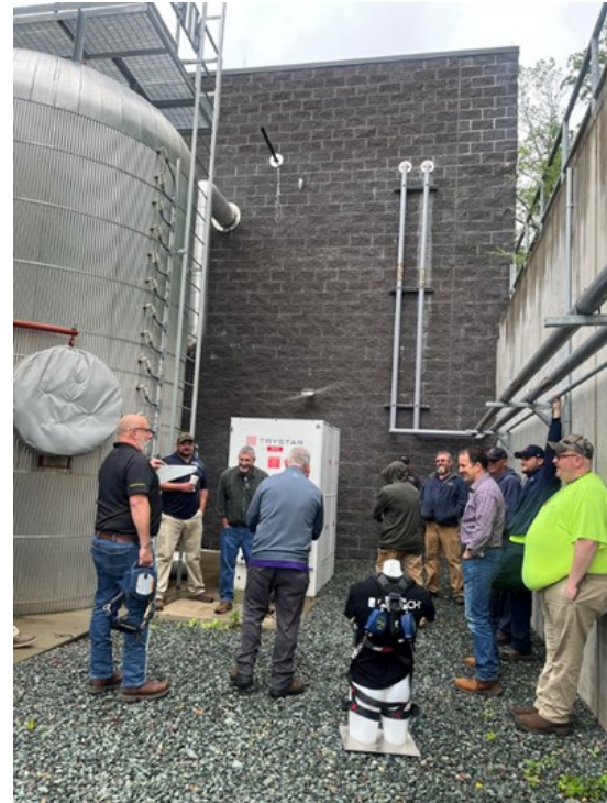
Vertical ladder safety training at the Chiller Plant on Thursday, June 22, was a success!

If you have ladders in your work area that need assessing or inspecting, please email FM-OHS@virginia.edu .