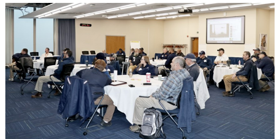
Pictured: January Supervisor Learning Journey

Are you interested in joining the next cohort? Email fm-training@virginia.edu to learn more about the program or be added to the waitlist.