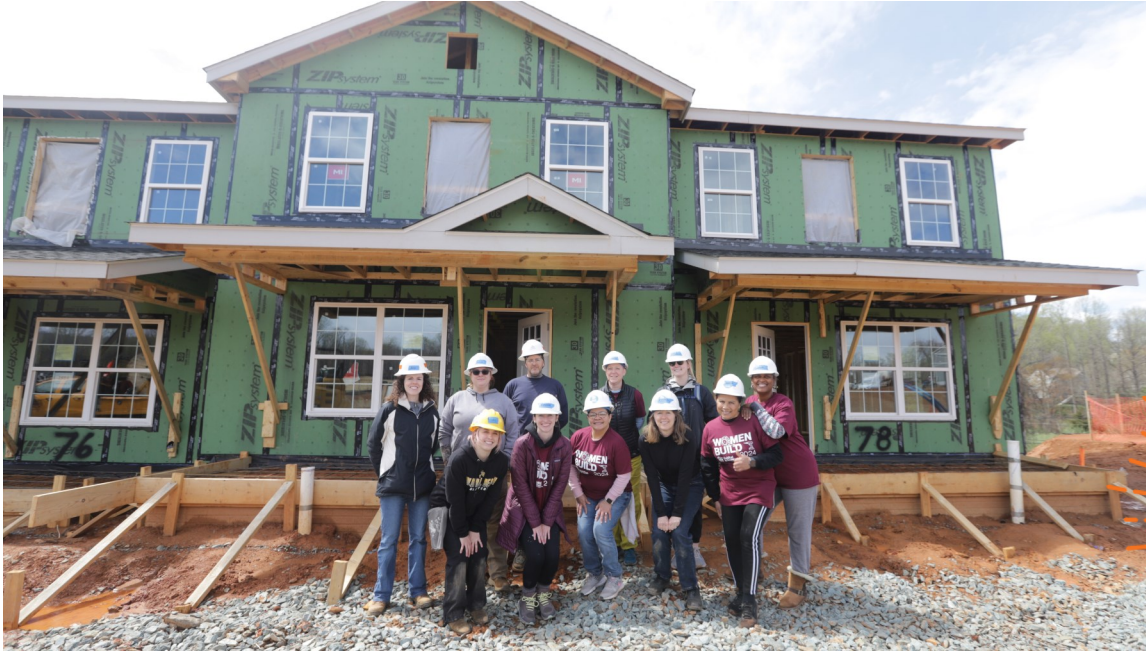
Pictured: April 4 Habitat Day volunteers.

Thank you to all of our colleagues taking part in Build Days with the Habitat of Humanity of Greater Charlottesville. Your work has a significant impact, bringing our area closer to the goal of creating safe and affordable housing for all.