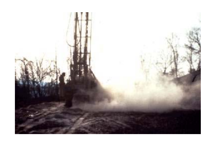
Drilling without water

Your actual exposure will depend on the wind, where you stand and if you use water to control the dust.