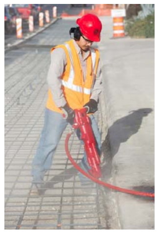
Generates moderate to heavy amounts of dust