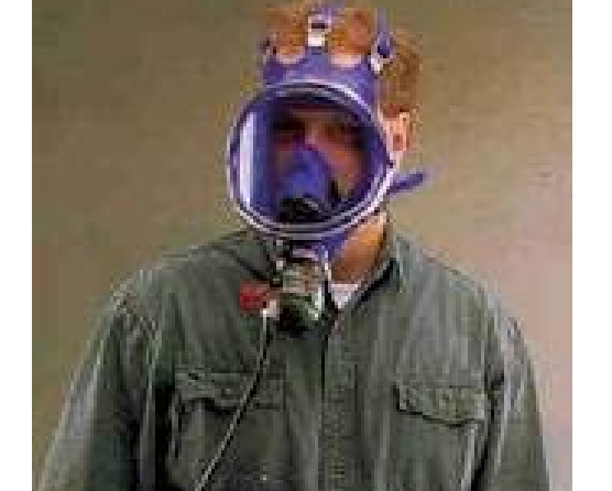
Supplied air respirator