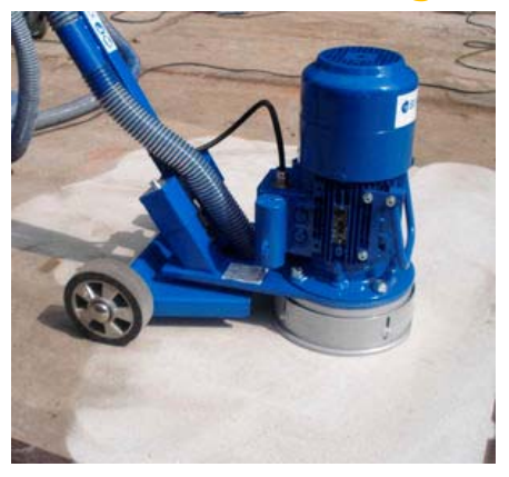
Generates heavy amounts of dust