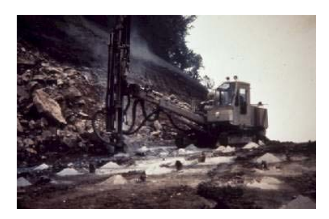
Drilling with water

Rock drilling without water produces large amounts of dust.