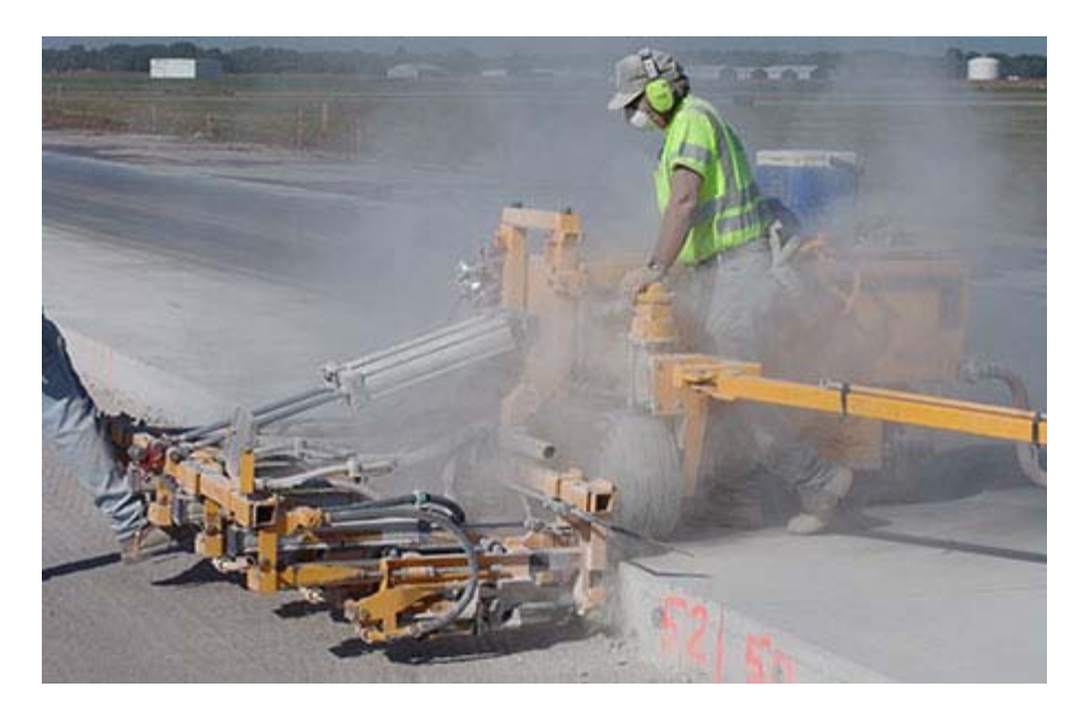
Generates moderate amounts of dust