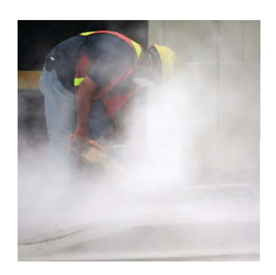
Generates large amounts of dust