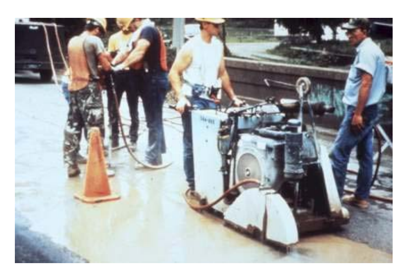
Using water to cut concrete and bricks