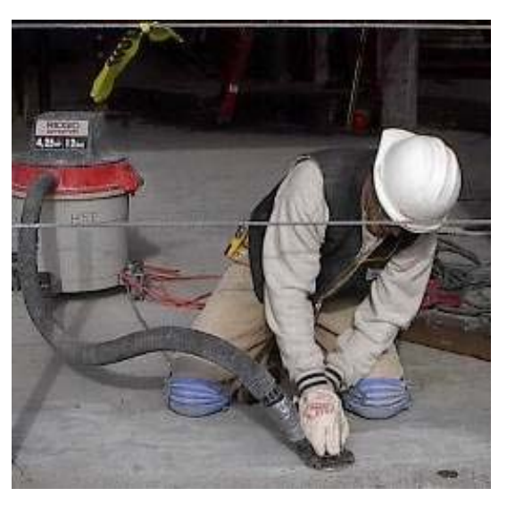
Concrete sander with exhaust ventilation