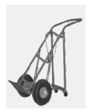
Transportation: Use appropriate carts for transporting cylinders