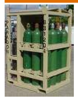
Storage: Cylinders must be secured to prevent tipping.

Compressed gas cylinders can pose serious hazards. Their contents can present chemical hazards (flammable, toxic, corrosive) and the cylinders could present a physical hazard.