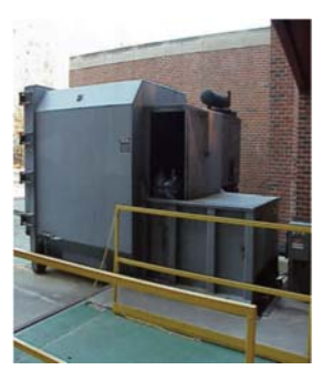
Never reach inside the hopper of a compactor, use a long stick if needed