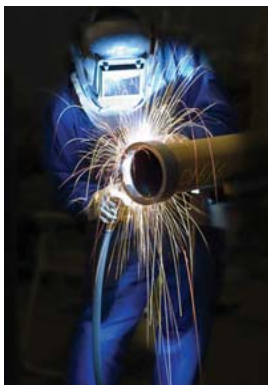
Employees must wear required PPE

Operations that create a spark or flame such as welding and soldering are referred to as hot work. Special precautions are necessary to perform hot work safely. Hot work procedures must be understood by operators and building managers and all occupants should be familiar with basic safe work practices.