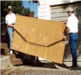
Use resources: ask for help from coworkers and use available mechanical aids