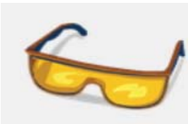
Safety glasses offer good protection, but they must fit properly. Try various size and styles for the best fit.