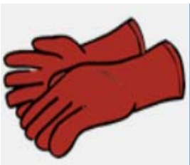
Nitrile gloves offer reasonable protection for a wider range of chemicals.